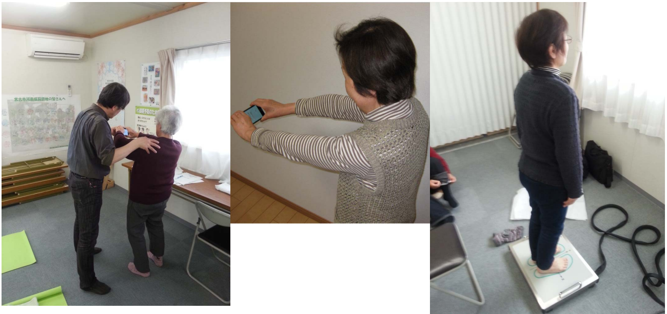
Fig.1 Balance training program for the elderly to prevent falling by use of new devices.