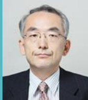
Nihon Keizai Shinbun (Nikkei) Deputy Chief Editorial Writer