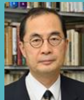
Rissyo University Professor, Faculty of Economy