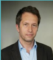
The School for Advanced Studies in the Social Sciences (EHESS) The Fondation-France - Japon de l' EHESS Professor