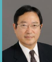
Keio University Professor, Faculty of Commerce